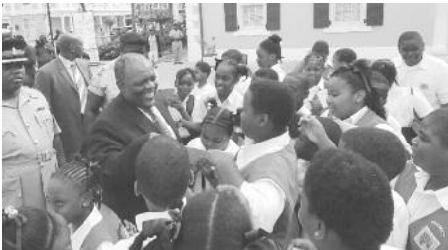
The Hon. Hubert Ingraham, Prime Minister of The Commonwealth of The Bahamas was greeted recently outside house of assembly by students of Our Lady's Catholic School.