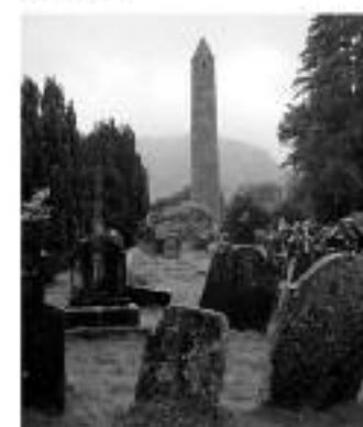
Monastic Site Dublin, Ireland