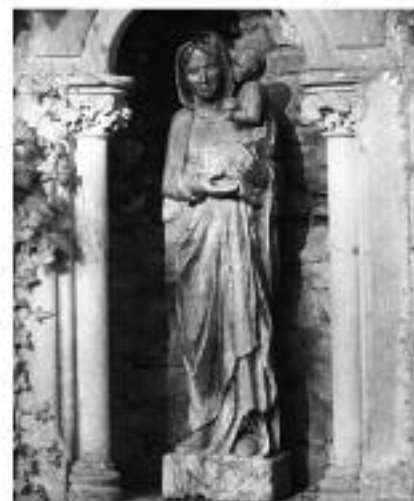
Madonna & Child Bunratty Village, Ireland