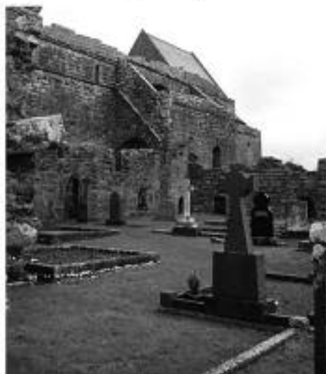
Corcomroe Abbey, Ireland