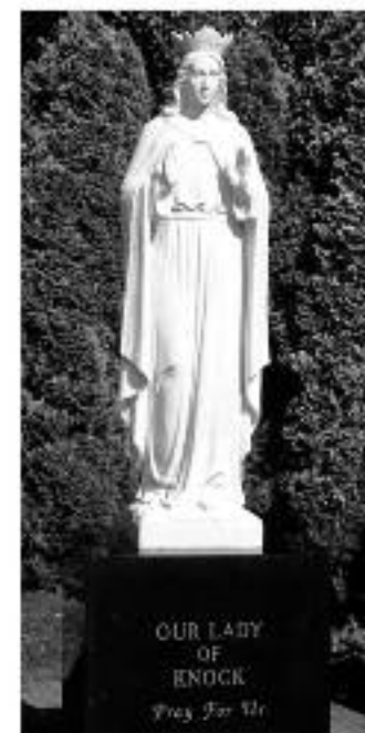
Our Lady of Knock Knock Ireland