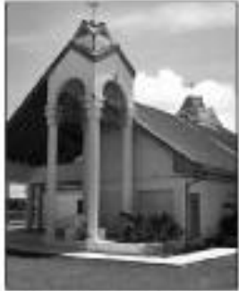
St. Cecilia's Catholic Church