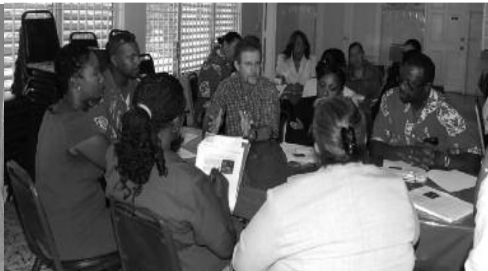
Teachers from primary and high school in group discussion.