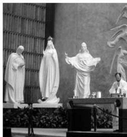
Church at Knock Knock, Ireland